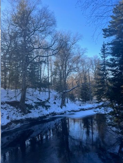
Jessup River from the view of a bridge, Hamilton County