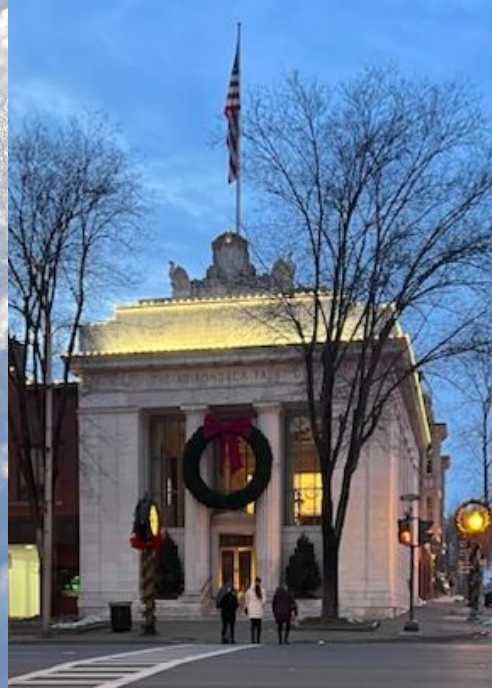
The Adirondack Trust company & its wreath, Saratoga Springs