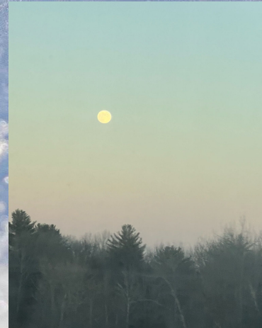
5pm sunset, Speculator