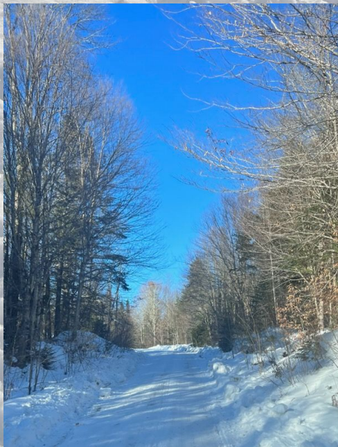
Near Pillsbury Mnt, Speculator, NY